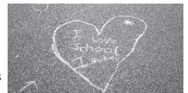
Drawn on elementary playground by 2nd grade student, Isabell Wooley.

Remember to vote on or before February 14, 2012