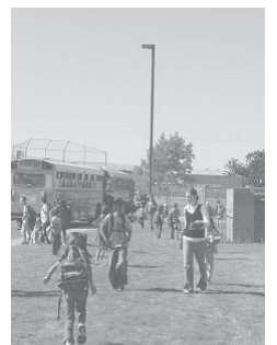
Elementary students head for the buses. Fall 2011