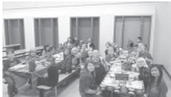
Mathematicians Honor Table