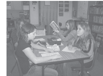
Middle School students, success in the classroom.

The purpose of the STAR period is to get to know the students and help them to gain the skills to be successful in the classroom. The skills include study habits, organization and, generally, how to study.